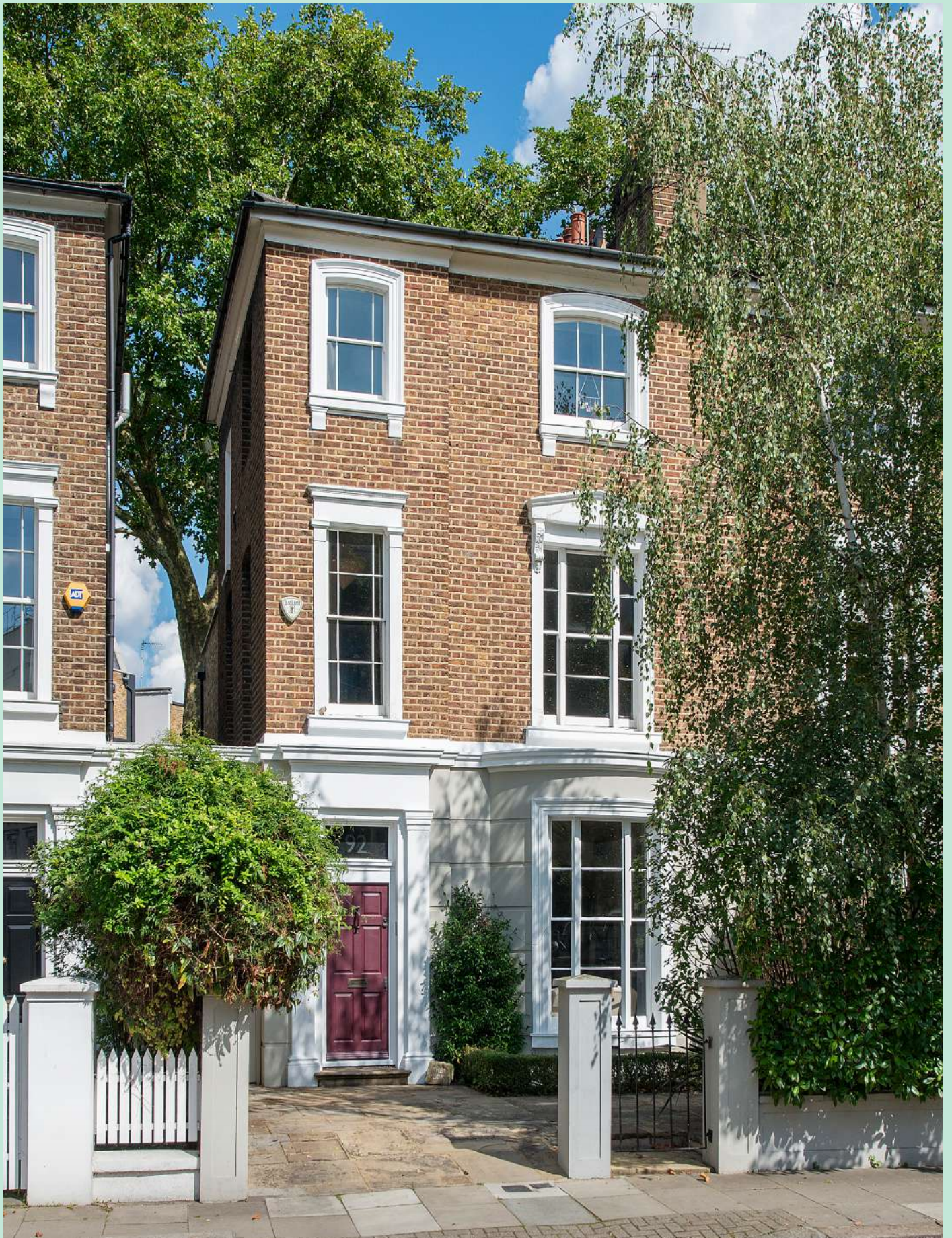
Westbourne Park Road Notting Hill W2